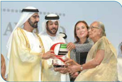
Zulekha Hospital was felicitated with the Dubai Quality Award for 2014 cycle by His Highness Sheikh Mohammed Bin Rashid Al Maktoum, UAE Vice President and Prime Minister and Ruler of Dubai.