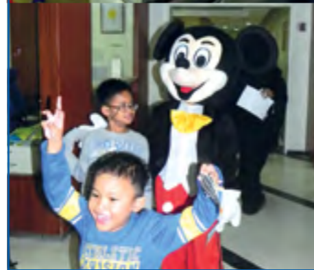
Free Health Check Up