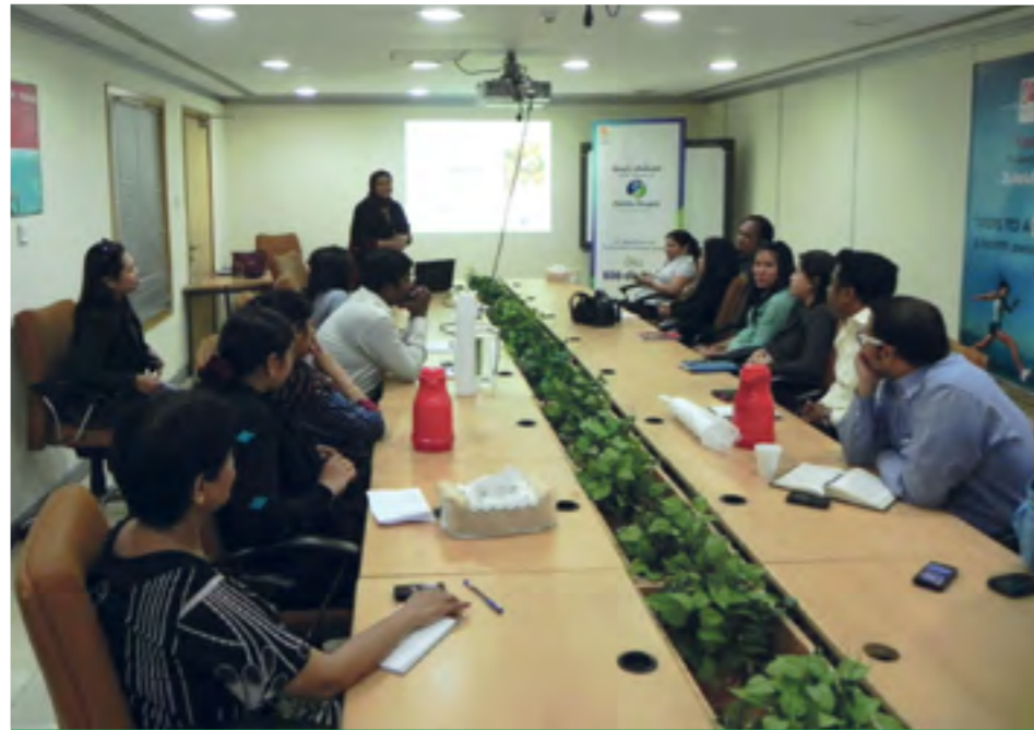
Diet Education @ EROS