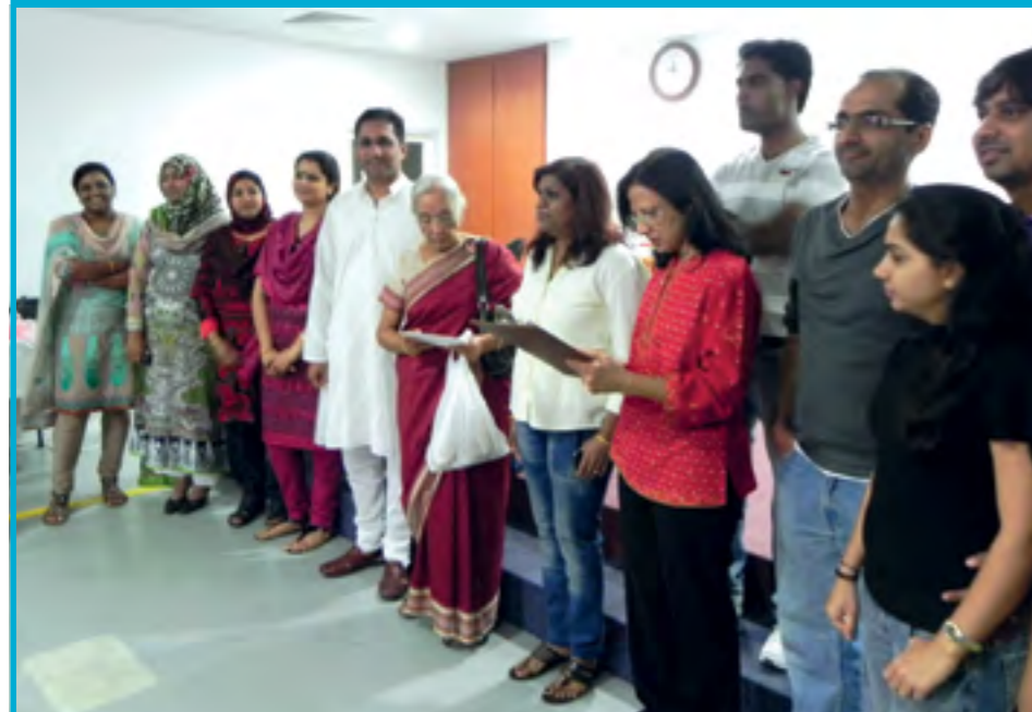
Sandwich Competition @ Zulekha Hospital