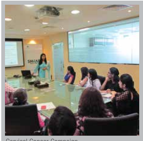
Cervical Cancer Campaign