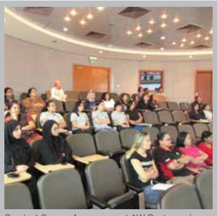
Cervical Cancer Awareness at AW Rostamani