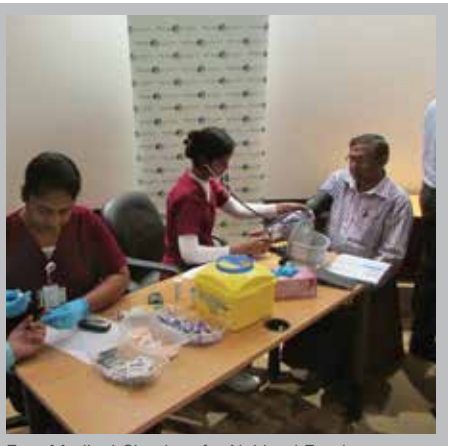
Free Medical Checkup for Nakheel Employees