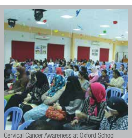
Cervical Cancer Awareness at Oxford School