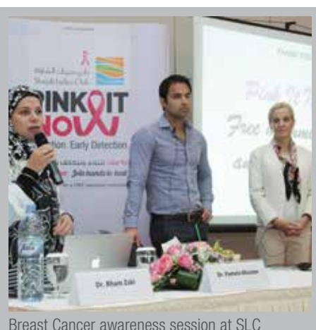
Breast Cancer awareness session at SLC