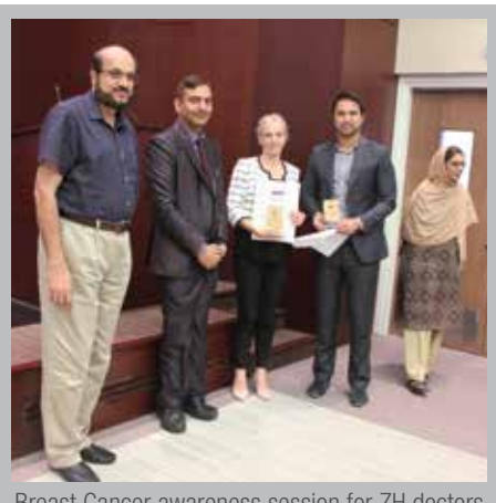
Breast Cancer awareness session for ZH doctors