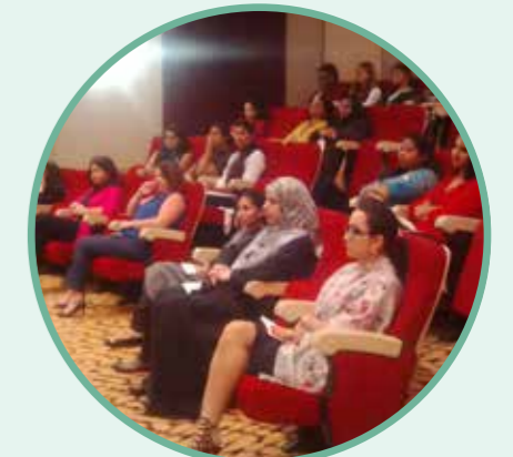
Breast Cancer Awareness Talk at Petrofac