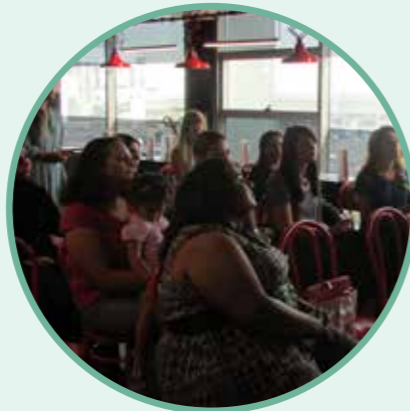
Breast Cancer Awareness Talk at Beauty Connection Spa