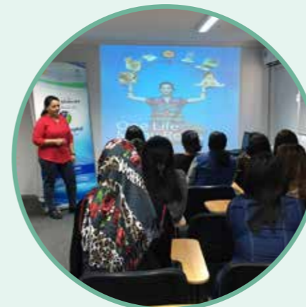
Breast Cancer Awareness Talk at Emrill