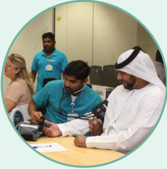
Cardiac Checkup Camp at Transguard Group offices