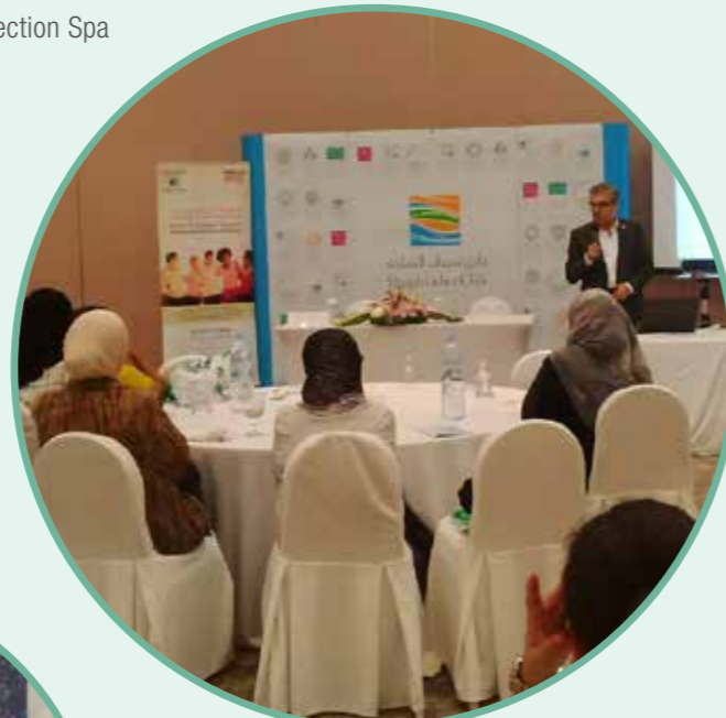
Breast Cancer Awareness Talk at Sharjah Ladies Club