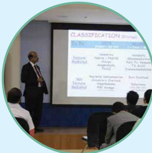
Blood Transfusion Practices Session at Alexis Multispeciality Hospital