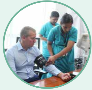
Cardiac Checkup Camp at Laing O'Rourke Offices, Deira and Jebel Ali