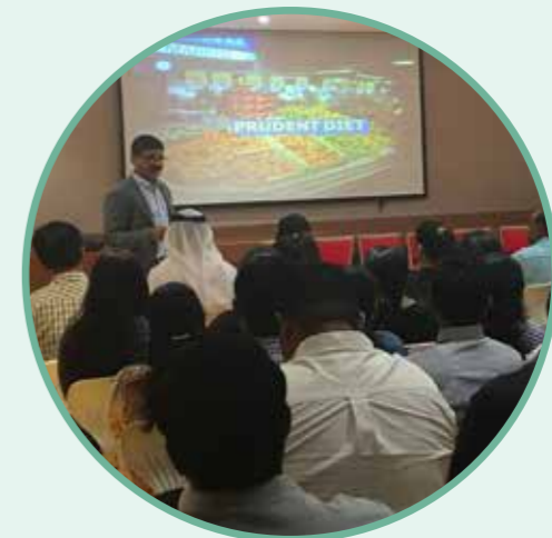
World Heart Day Activity Health Talk at Corporate Companies