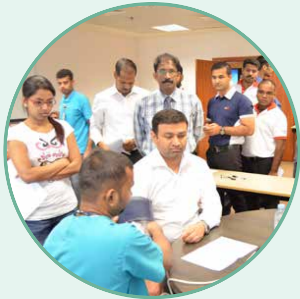
Cardiac Checkup Camp and Health Talk at AW Rostamani Head Office