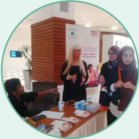
Breast Cancer Awareness Session at the New Sharjah Chamber of Commerce and Industry