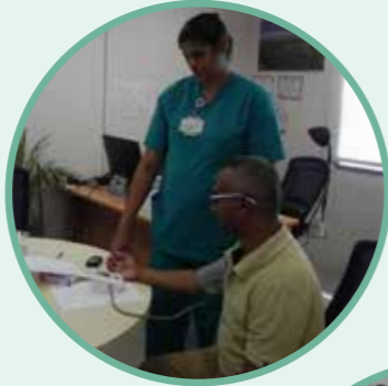
Cardiac Checkup Camp at Saipem offices, BM Towers and Port Khalid