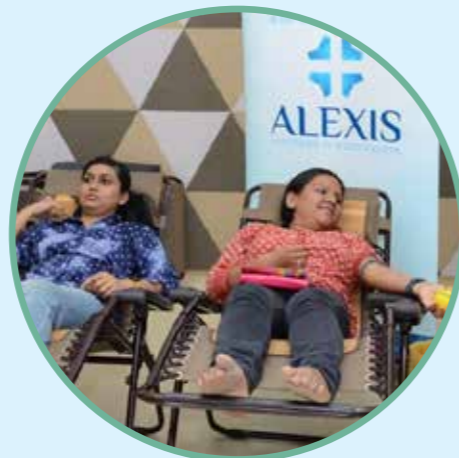
Blood donation camp conducted at Alexis Multispeciality Hospital