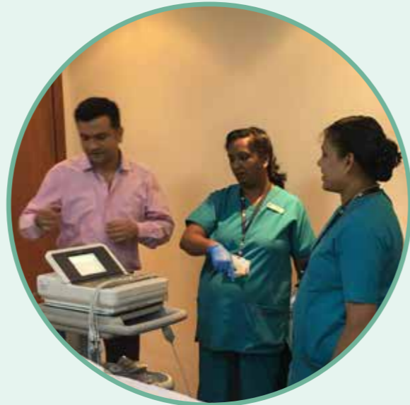
Cardiac Checkup Camp at Arcelor Mittal Offices