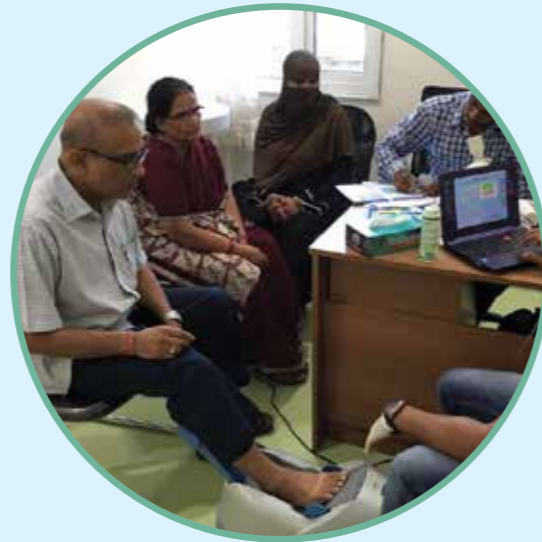
Alexis Multispeciality Hospital conducted a free Bone Mineral Density checkup camp