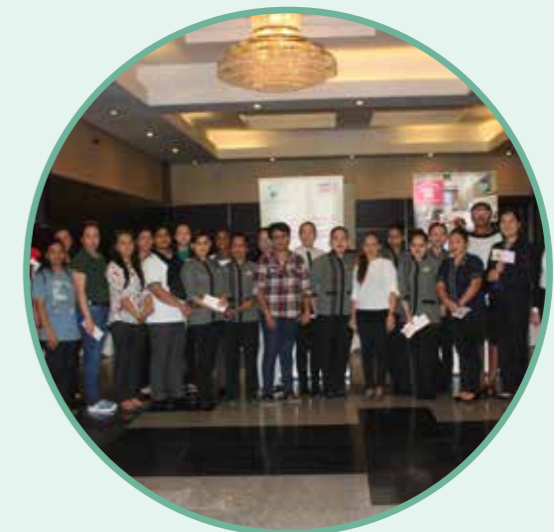
Breast Cancer Awareness Talk at Ramada Hotel and Suites Ajman