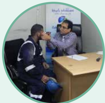
Eye Checkup camp at Mammut Hamriyah Free Zone