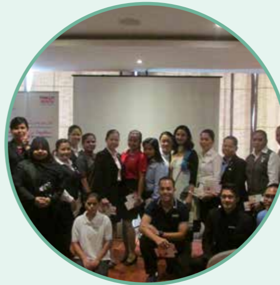
Breast Cancer Awareness Talk at Hotel Yassat Gloria