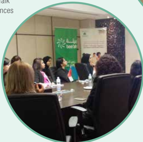
Breast Cancer Awareness Talk at Bee'ah Office