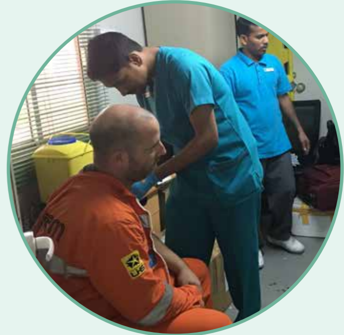
Flu Vaccination at Saipem Offices