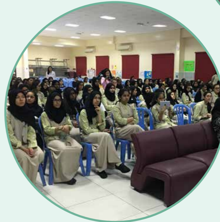
Breast Cancer Awareness Talk at Oxford School