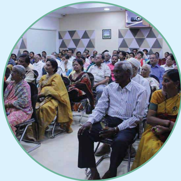
Breast Cancer Awareness Talk at Alexis Hospital on the importance of 'Self Check' and how to remain watchful of unwanted signs and symptoms which might lead to Cancer.