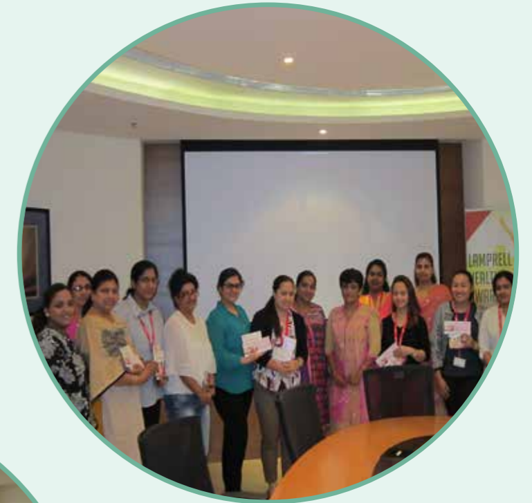
Breast Cancer Awareness Talk at Lampell