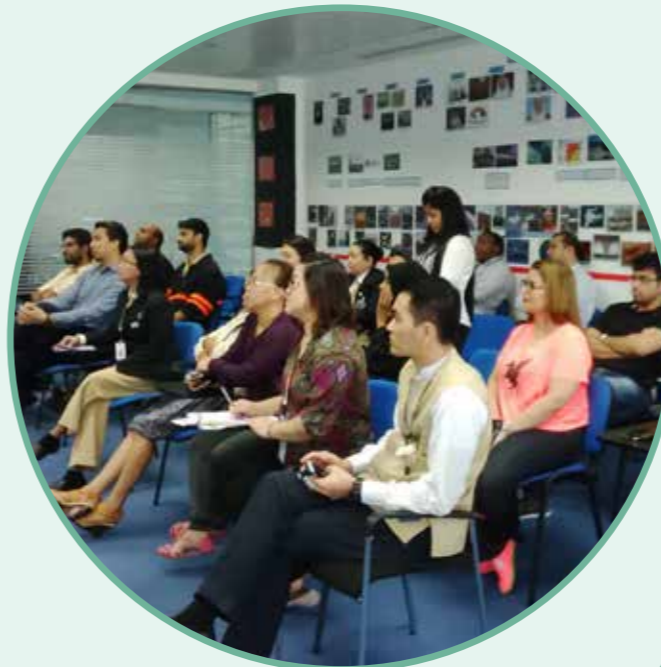
Health Awareness Talk at Serco Middle East