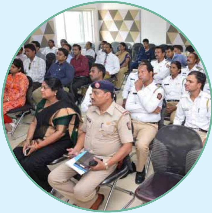
Alexis Multispeciality Hospital Eye Screening and Awareness Programme for Maharashtra Police