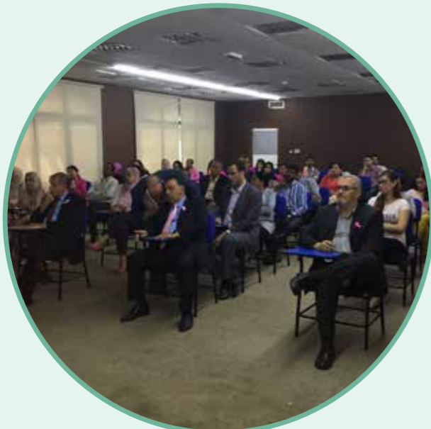
Breast Cancer Awareness Talk at University of Modern Sciences