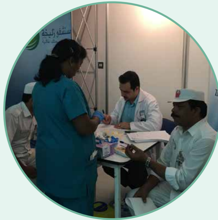
Health Checkup Camp at Dubai Police