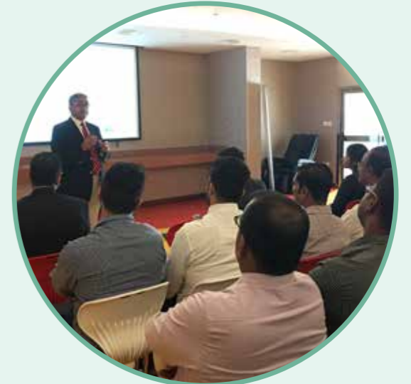
Diabetes Awareness Talk at Al Shirawi