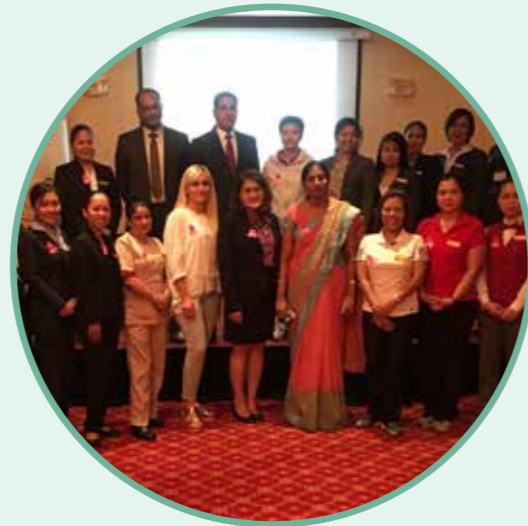
Breast Cancer Awareness Talk at Al Bustan Centre and Residence