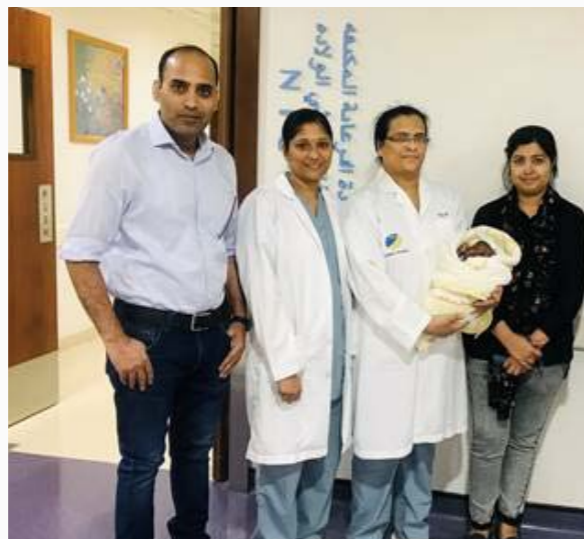
The Nursing Team with the baby and his family

The 24/7 NICU at Zulekha Hospital, Dubai is a level 3 accredited by the DHA that accepts premature babies from 23 weeks onwards and manages neonatal illnesses of all degrees of severity. The neonatologists work closely together with the nursing team and the resident doctors, supported by a multidisciplinary team including paediatric specialists and surgeons, general physicians, neonatal nurses, dietitians, and pharmacists. With strict infection control protocols, the NICU team employs the latest in medicine and technology for the highest quality care of preemies.