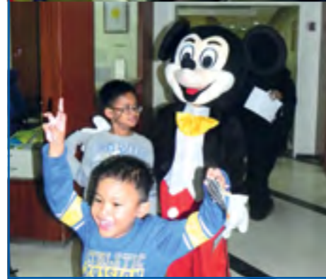
Free Health Check Up