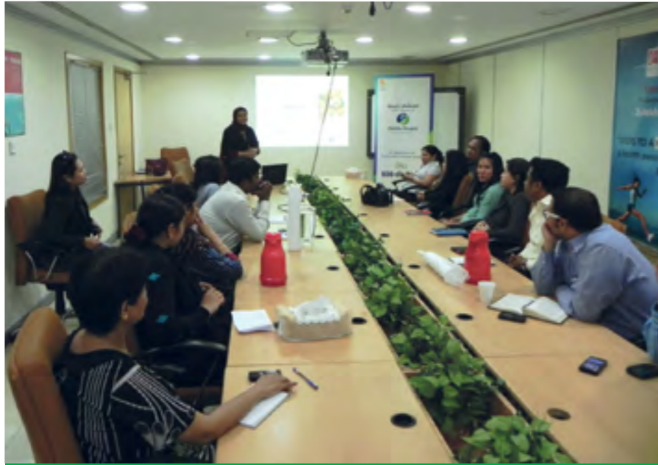
Diet Education @ EROS