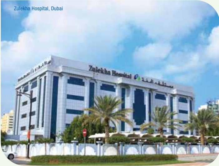
Zulekha Hospital, Dubai