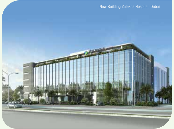
New Building Zulekha Hospital, Dubai